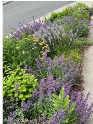
"Creating Habitat in Public Spaces" by Karen Walton, CMG Read in full here