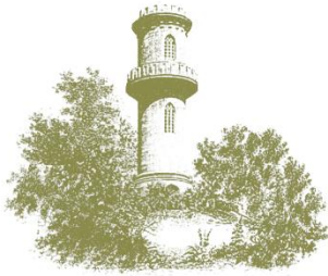
MOUNT AUBURN CEMETERY A National Historic Landmark

New England Botanic Garden AT TOWER HILL